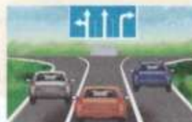
left; straight; right