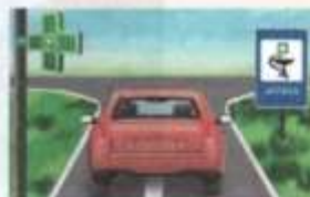
on the left; on the right